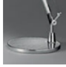
TOLOMEO BASE D 200 ALL A008600