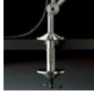
TOLOMEO MORSETTO A004100