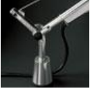
TOLOMEO SUPP.TAVOLO FISSO A004200